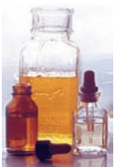
Aroma Apothecary Healing Arts Academy

Aroma Apothecary Healing Arts Academy offers beginning to advanced programs. We offer professional quality courses and products for health professionals, retailers and others with an interest in aromatherapy and natural healing. Aroma Apothecary offers a leading edge Aromatherapy Distant Learning Course, as well as in-depth advanced clinical training for those pursuing a career in the healing profession. CE provider for massage therapists. Call 512-282-6099. 8100 Gantcrest Drive, Austin, TX 78749 or on the web: www.AAHAA.INFO .