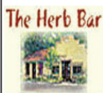
The Herb Bar